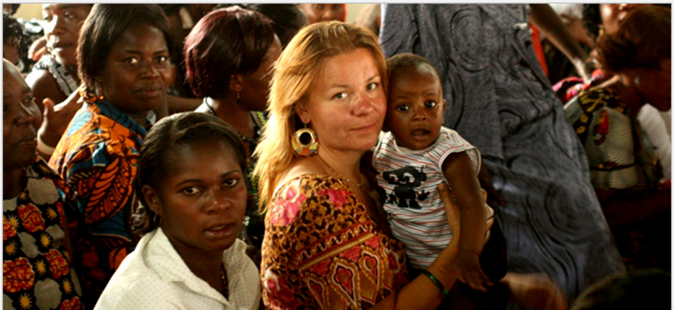
Fighting with The Poor