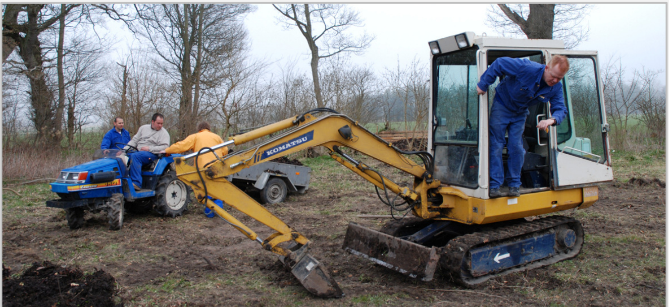
Do what you find most appropriate to do