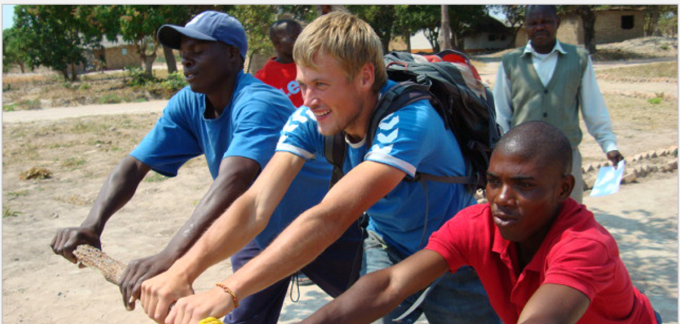
Practice field in Fighting with The Poor