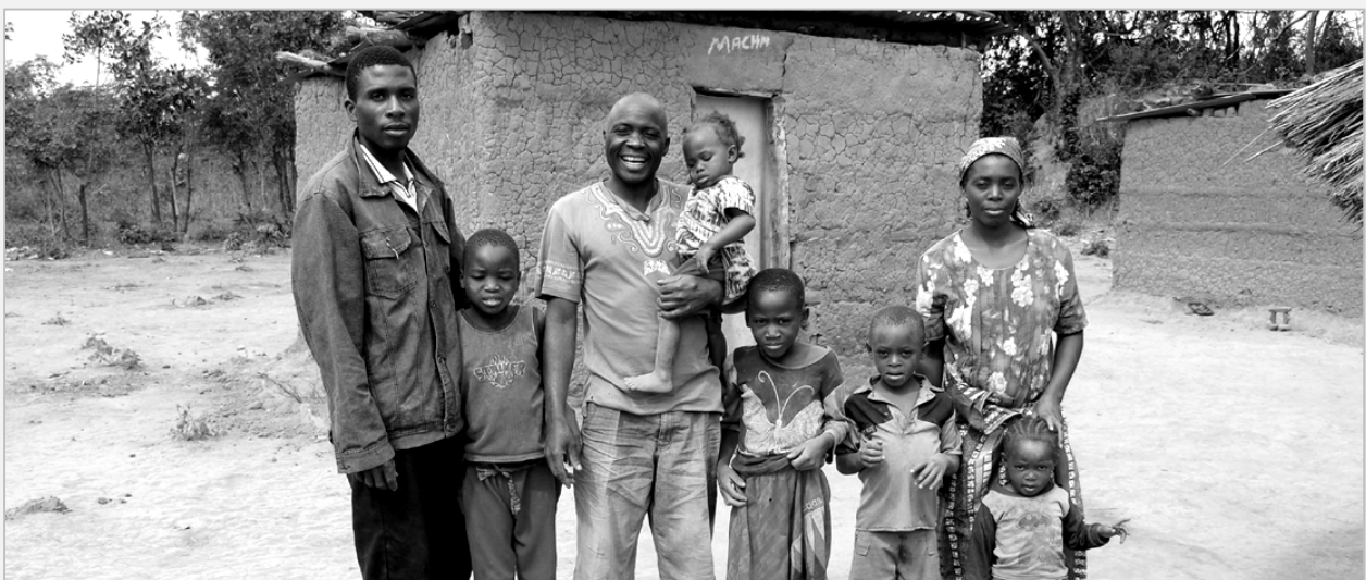
Family in Zambia