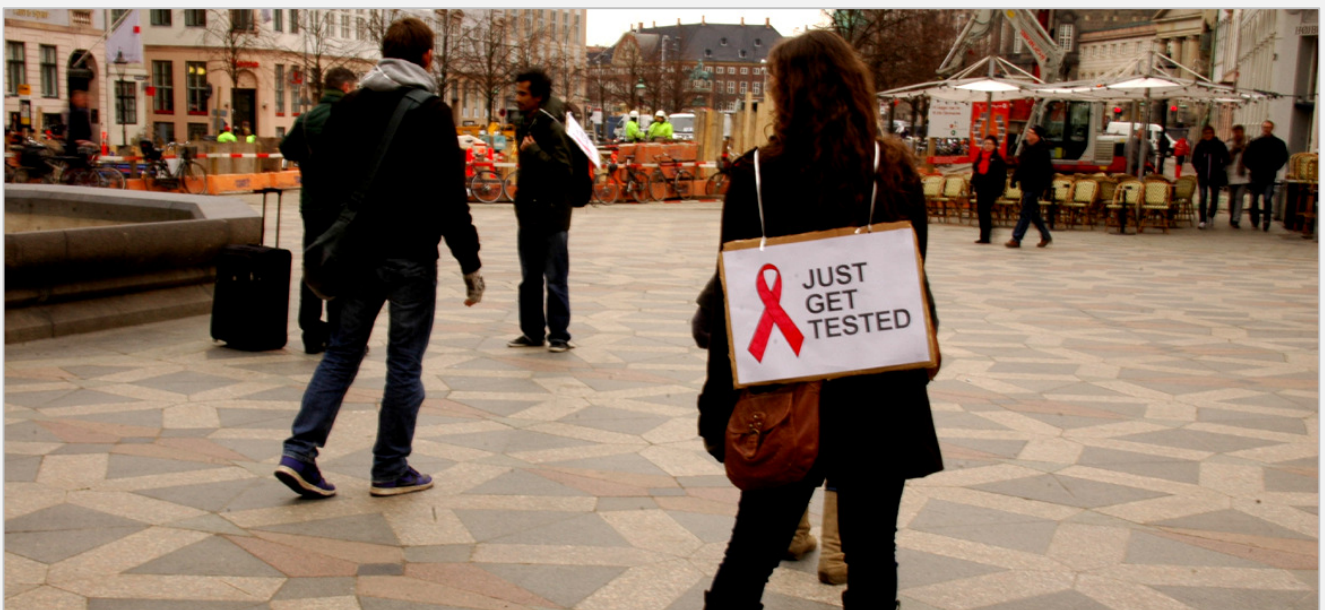
Bring it to The Public