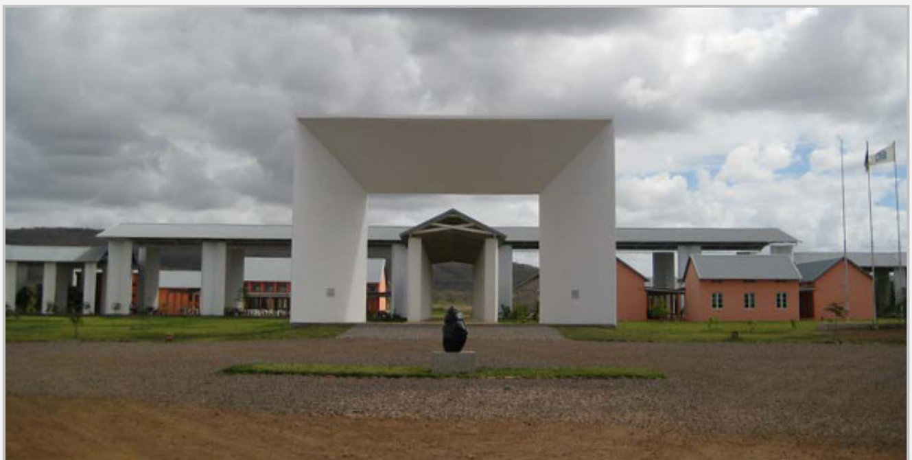
One World University Mozambique