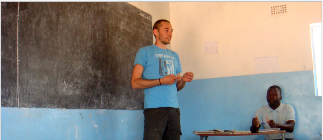
Practice field in Pedagogy