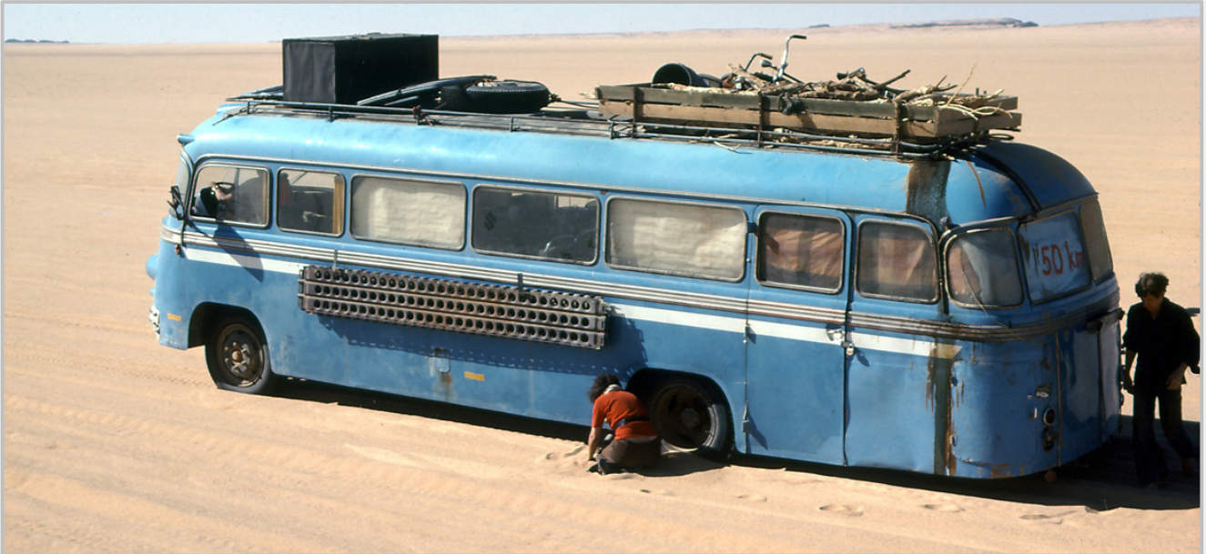
Bus travel through Africa